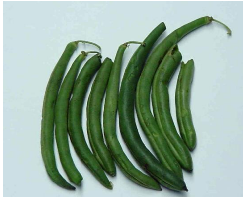
Grocery Store Beans